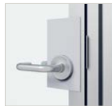
Mortise Lever, Title 24